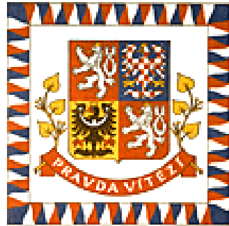
„Prezidentská standarta“ flag of the President