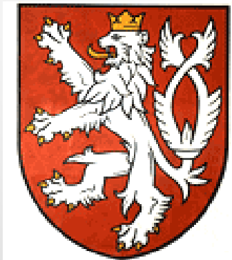
Small coat of arms of the Czech Republic