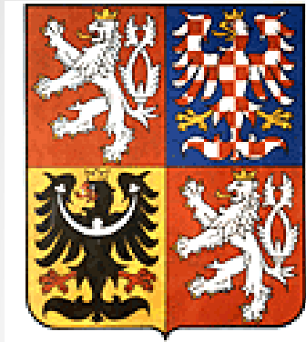
Coat of arms of the Czech Republic